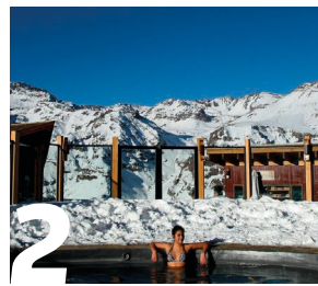
2 Valle Nevado