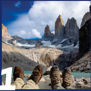
1 Hiking Torres del Paine