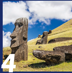
4 Rapa Nui (Easter Island)