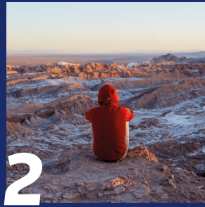
2 Atacama: The desert that looks like Mars