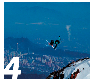
4 La Parva