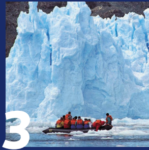
3 Patagonia Glaciers