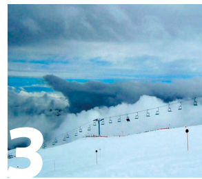
3 El Colorado